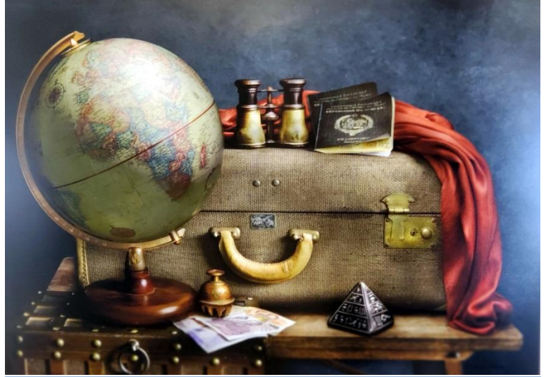
Photography First Place: "Still Life No. 2", Linda Flicker