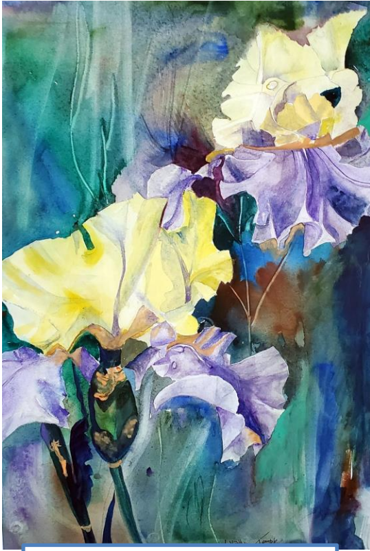
2D First Place: "Iris", watercolor, Lyallyn Temple