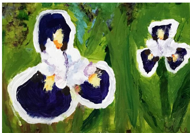
Youth Art First Place, "Dos Bontias", acrylic, Everette McCarthy, 7 years old