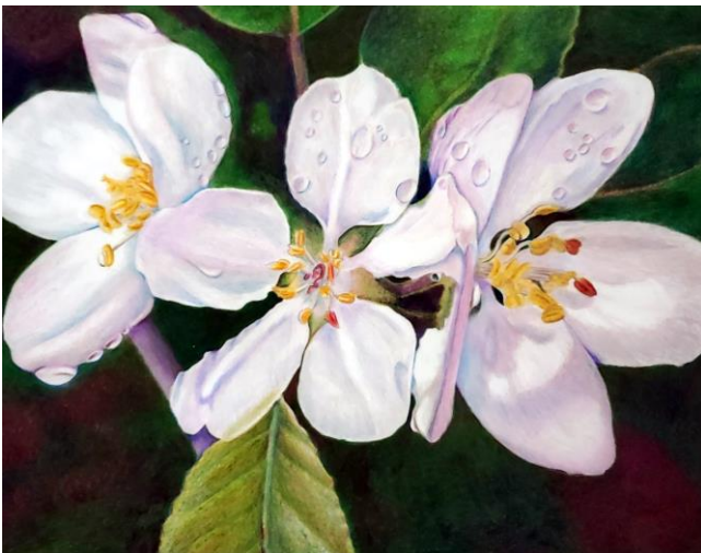
2D First Place, "A Shower of Blossoms", colored pencil, Karen Saleen