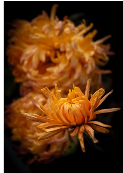
Photography First Place: "Good Morning Sunshine", photograph, Suzie Torre-Cross