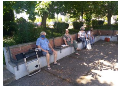
ART ON THE PATIO

We are planning more classes on the patio...the next one may be co-sponsored by the Marion County Dog Shelter. What do you think the subject will be.....drawing dogs? You are probably correct!