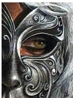
2D Second Place: “The Watcher”, Vicky Vickery

This painting gives the viewer a strong sense of narrative and context for the group of figures through the expert line work in the race car in the foreground. Light watercolor washes complement the sunlit faces to create a mood of lightheartedness and joy. The expert use of perspective and overlapping shapes adds to this unique and creative style of portraiture. Great job.