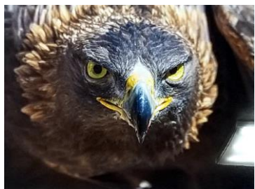
Photography Second Place: "Golden", Craig Leaper

This photo uses dramatic color, exciting contrasts in texture, and strong composition for its larger-than-life subject. The viewer is also engaged by the beetle's close attention to the leaf and might create a story about where the beetle is going next.