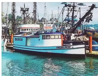
Digital Art First Place: "Chelsea Rose Fresh Crab", Gary Olsen-Hasek

This three-dimensional art stands out for its use of natural materials arranged in a design that is graceful and poetic. This is a fun piece full of interesting textures. The careful placement of small pieces of color woven into the nest adds interest. Nicely done.