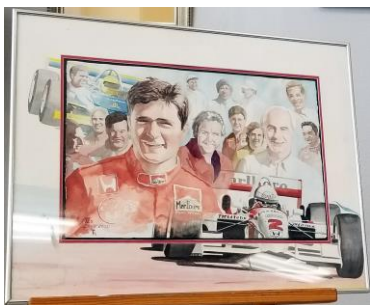
2D First Place: “Penski’s Men”, Alan Nies

This painting gives the viewer a strong sense of narrative and context for the group of figures through the expert line work in the race car in the foreground. Light watercolor washes complement the sunlit faces to create a mood of lightheartedness and joy. The expert use of perspective and overlapping shapes adds to this unique and creative style of portraiture. Great job.