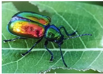
Photography First Place: "Dogbane Beetle", Craig Leaper

This portrayal of a calm water-filled landscape is punctuated by contrasting textures and shapes of foliage in warm and cool greens and neutrals. A horizontal orientation and directional lines of floating sticks, leaves, and a large feather lead the eye around the painting and create a peaceful mood. A reward for the careful observer is the discovery of subtle leaf shapes just below the water's surface on the left side of the painting. This is a creative and intriguing landscape.