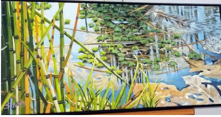
2D Third Place: "The Shallows", Carol Sims

This portrayal of a calm water-filled landscape is punctuated by contrasting textures and shapes of foliage in warm and cool greens and neutrals. A horizontal orientation and directional lines of floating sticks, leaves, and a large feather lead the eye around the painting and create a peaceful mood. A reward for the careful observer is the discovery of subtle leaf shapes just below the water's surface on the left side of the painting. This is a creative and intriguing landscape.