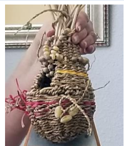
3D First Place: "If I Were a Swallow", Janice Jenkins

This compelling "up close and personal" view of a Golden Eagle catches the viewer's eye immediately. The bird fills the frame with an unusual pose at an angle to the viewer, and the eyes and beak are in sharp focus closest to the viewer, all of which suggests a powerful animal that commands respect. The limited color palette of the bird's feathers allows the sunlight to be the key player in defining the feathers and contours of the animal. This regal portrait reminds us of the strength, complexity and diversity of the natural world. Nice work.