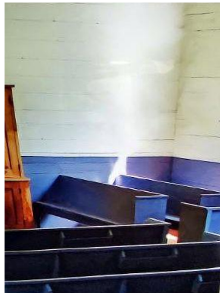
Digital Art First Place: "New Light Presbyterian", Gary Olsen-Hasek