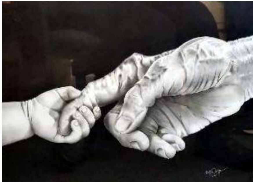
Best of Show: “100 to 1”, pencil, Michael Dora