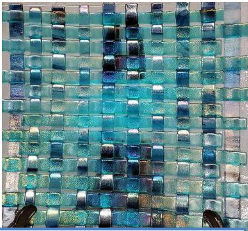
3D First Place: "Ocean Weave", fused glass, Mona Prater