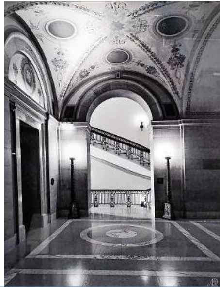
Photography First Place: "Capitol Meditation", Gary Olsen-Hasek