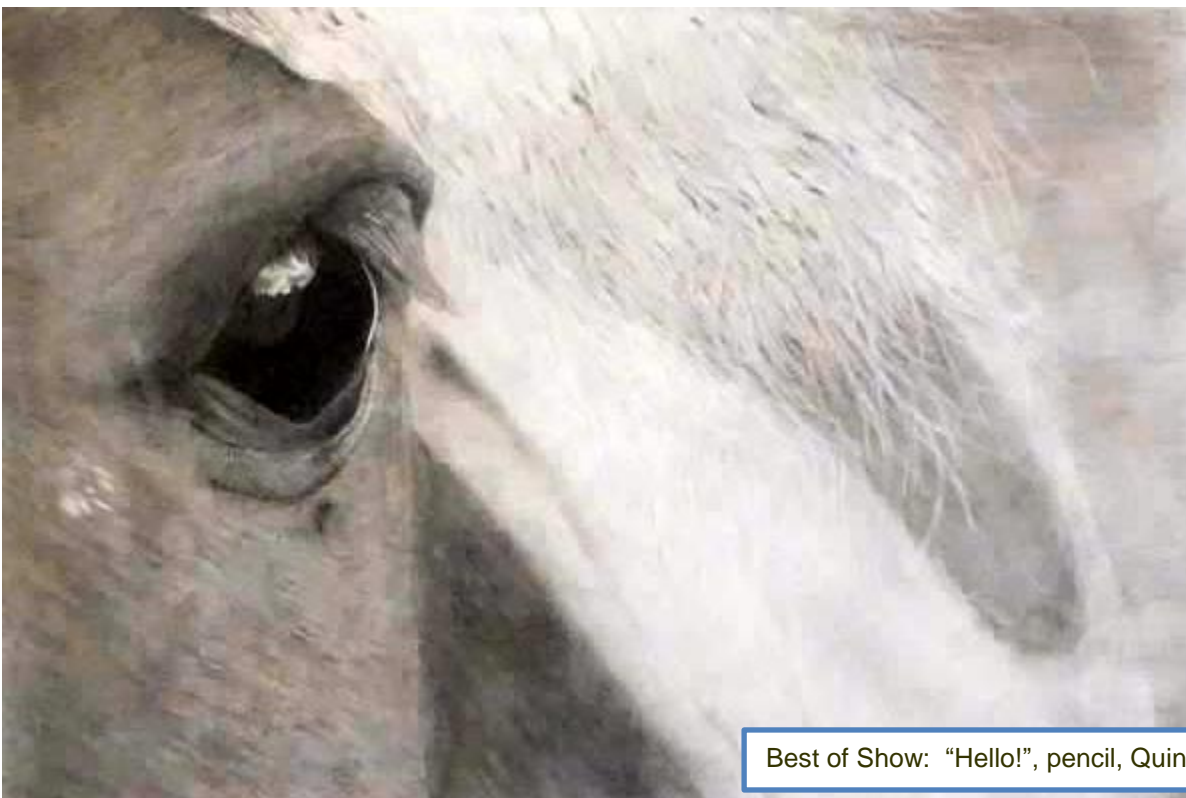
Best of Show: "Hello!", pencil, Quinci Woodall, 14 yrs.