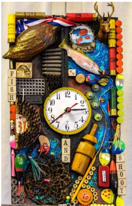
First Place 3D: "Sports Clock", mixed media. Jody Farley