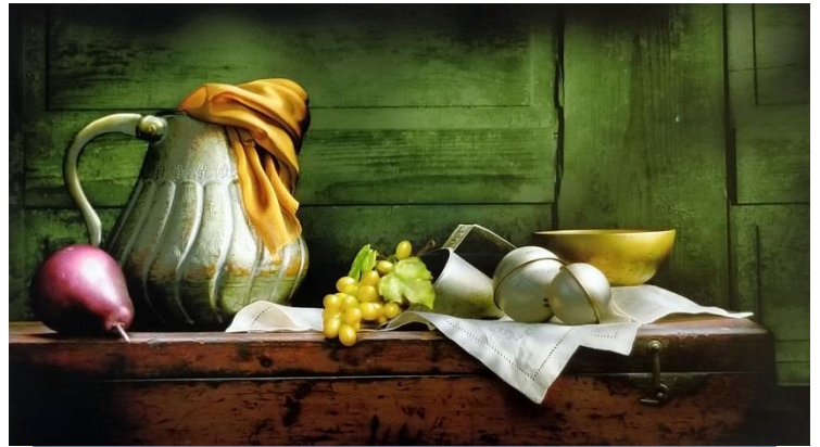
Photography First Place: "Painted with Light", photograph, Linda Flicker