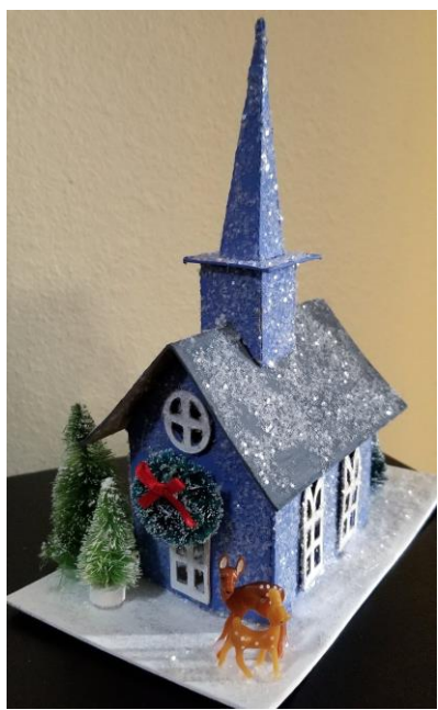
Gallery K Artist of the Month, January, 2019

I hope you enjoy them. Contact me at onenewithall333@gmail.com "