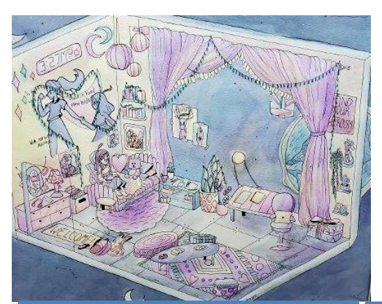
2D, watercolor, First Place: "Isometric Adiline", watercolor and