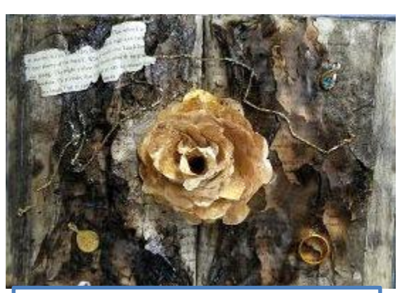
3D First Place: "Burning Hope", mixed media, Ariel Buick