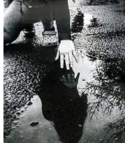
Photography First Place: "Look, a Puddle!", photo, Abbie Covalt