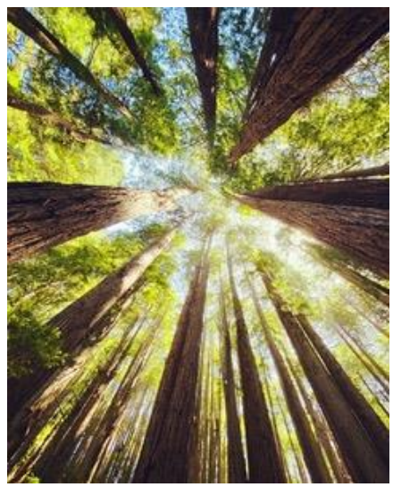
First Place, "Growing Up", Abbie Covalt

Though this idea is often the subject in many photos, I think that shows how we are fascinated by the grandeur of a forest. This point of view provides a sense of depth as well as a feeling of motion into space. The contrast of the dark trunks and bright exit point adds to this motion. Wonderful image!