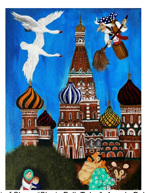
Best of Show, "Slavic Folk Tales", Angela Bakanov

This painting on canvas tells a story with its vivid colors, architecture and position of the characters. The towering buildings draw your eyes up and away from the drama below. Heralded by flying swans, a witch-like actor, the theft of a baby by a bear and a frightened mother and child--This piece of art tells a classic tale. Well done.