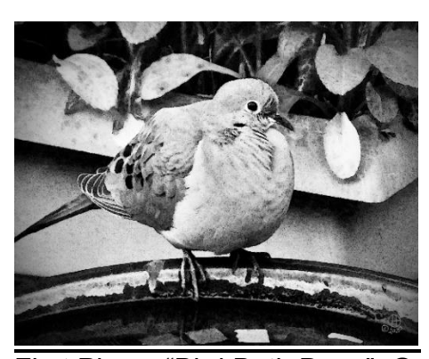
First Place, "Bird Bath Dove", Gary Olsen-Hasek

It's hard to imagine a soft bird being able to punch you in the face, but that's the feeling in this image. Gritty and strong lines, shapes and shadows, all leading to the eye of the dove drilling right through the viewer. Great composition and use of monotone!