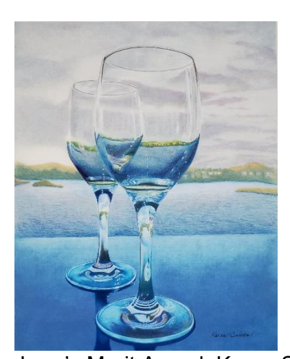
Juror's Merit Award, Karen Saleen

Water can be tricky and in this painting the water is tricking the eye several times. Water is everywhere at various levels in the glasses and in the background. When you look closely, the water in the glasses is actually the reflection of the background. Or is it? And, are there two glasses or three? The reflections in the glasses are superbly drawn and the glasses are so real that you can almost reach out and pick them up. Excellent.