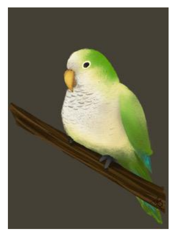
Angela Bakanov, Tango - First Place

Interesting light and contrast here. The angle of the branch gives the eye an interesting path to follow. I like the detail of the feather on the chest and the way the colors blend. Well done!