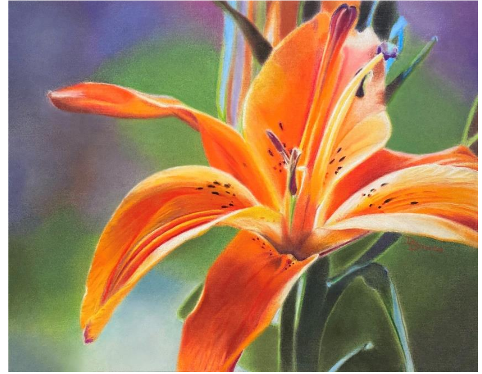
Best of Show, "Sunset In Full Bloom", colored pencil, Debbie Bowen

This flower grabs the observer with a burst of striking colors. The extended petals guide the eyes toward the edges and then lead you back to the center of this beautiful lily. You can look right into the depth of the flower. The background brings the Color Wheel in full circle. The light source outlines the leaves softly and the petals sharply. Well done.