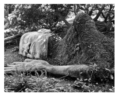
First Place, "Buddha Napping", Gary Olsen-Hasek

The detail of the ice-covered branches against the soft shapes in the background make this a great image. The eye is led off the frame to the right into that softness. The muted colors and darker tones help bring a very wintery feel to the image as well. Well captured!