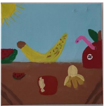
First Place, "Fresh Fruit", Kylie Sandler-Penick

The title "Fresh Fruit" is perfect for this painting of fruit sitting on a table with a tablecloth and the sun shining. The delightful little pink worm may be checking to see what his next meal might be! Nice job on size relationships of objects. This needs to be framed and placed in the kitchen.