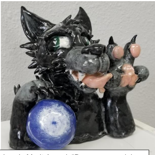
Juror's Merit Award: "Renesmee and the Life of Orb"