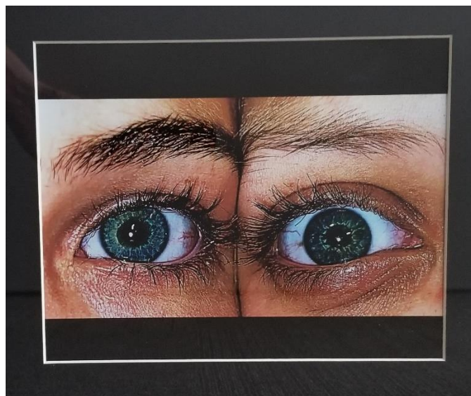
Photography First Place: "Eye Twins" by Madison Corpe