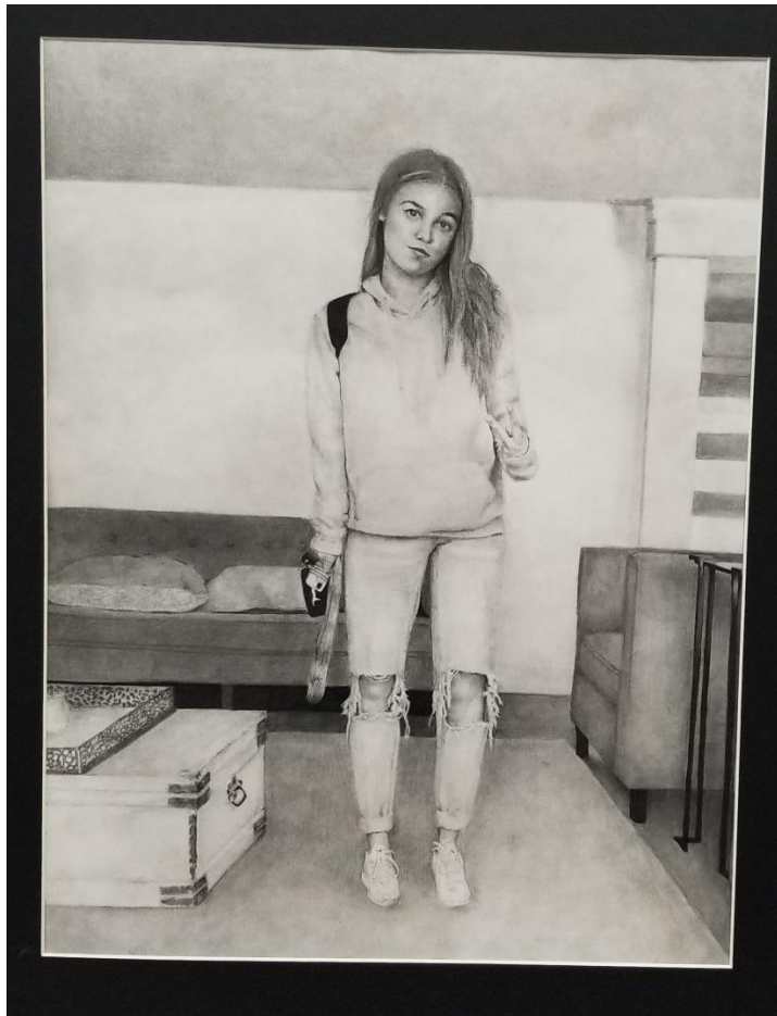
Best of Show: "Amster" by Angela Bakanov