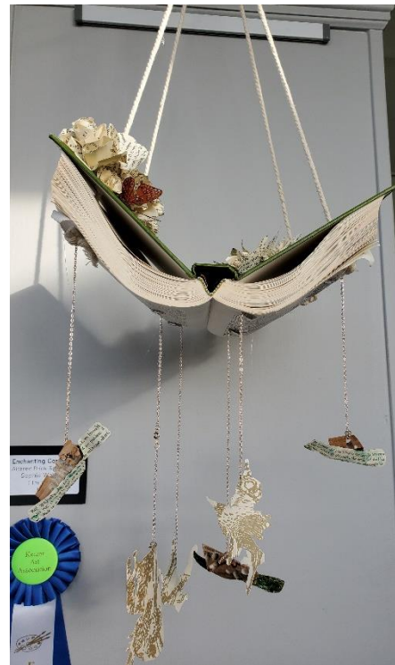
3D First Place: "Enchanting Content" by Sophia Waldon