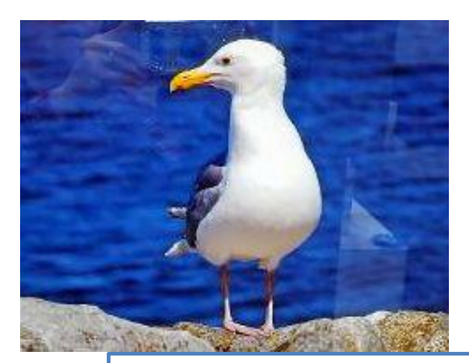
Photography First Place: "This is My Best Side", Gary Olsen-Hasek