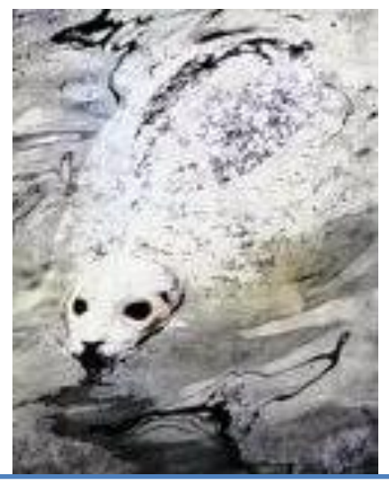
Digital Art First Place: "Broken Seal", Gary Olsen-Hasek