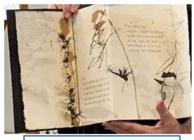
3D First Place: "Why I Feed the Birds", watercolor and ink, Penny White