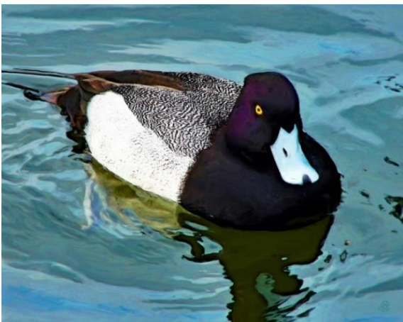
“Yellow Eyed Duck”, digital, Gary Olsen-Hasek