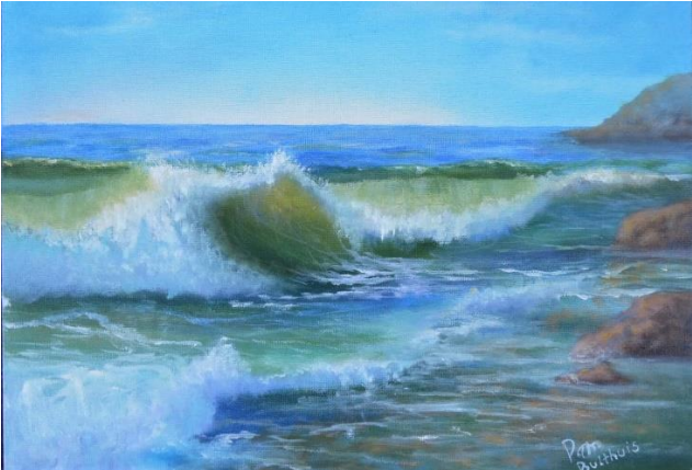
"Beach Wave", oil, Pam Bulthuis CONGRATULATIONS, PAM!