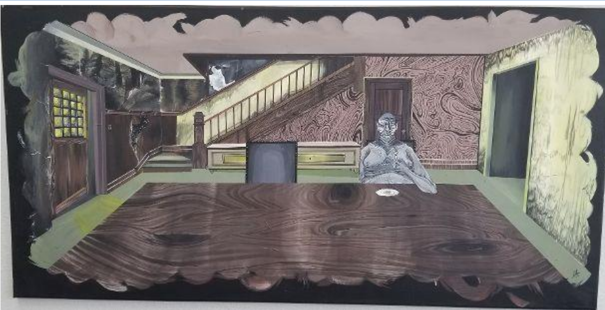
Best of Show, February, 2023, "Rotting in Solitude" by Melody Brush

This show will run from February 1 st through February 27 th .