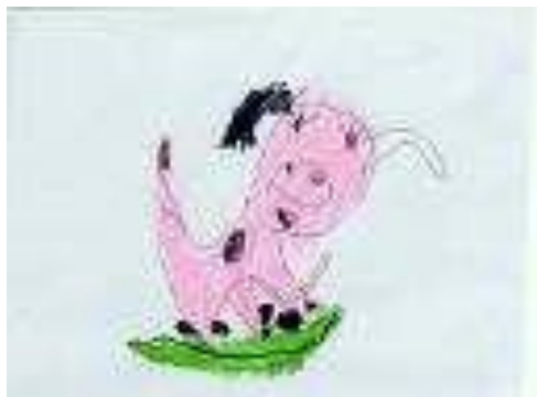
Youth Art First Place: "Pig", crayon, Ophelia Greer, age 4

"The paper mache sculpture is cleverly covered in newspaper comic strips, drawing the viewer in for a closer look. The bright red dog house and blue bowl create a perfect platform for presentation." --Kathy Haney