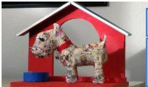
3D First Place: "Bob's House", paper mache and wood, Karen Stangeby

"The paper mache sculpture is cleverly covered in newspaper comic strips, drawing the viewer in for a closer look. The bright red dog house and blue bowl create a perfect platform for presentation." --Kathy Haney