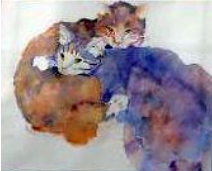
BEST OF SHOW: "Bonded Pair", watercolor, Nola Pear

"This is a strong composition. These intertwined abstract cat shapes create movement around the painting. The white shapes of the faces and paws draw you back around again. The details and contrast of light and dark of the face create a focal point. Though the two cats are of contrasting colors, the relative equal value and the incorporation of the contrasting color within the shapes connect the shapes." --Kathy Haney