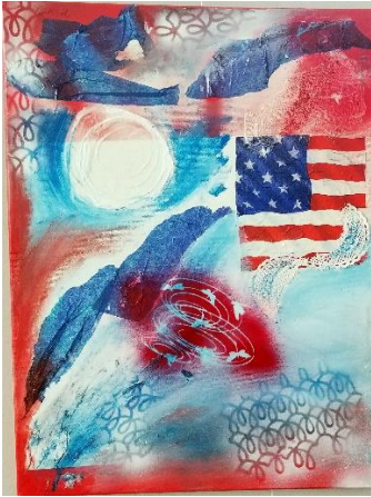
Third Place: "America", mixed media, Jody Farley

"What first drew me into this image were the interesting colors, textures and images, but it took a while to make sense of it, so I lingered. An interesting comment on the state of our country: it's fractured, broken, swirling with discord and at the same time, taken as a whole it remains beautiful. We are America Strong. The use of mixed media lends itself to the variety of textures found in the piece, giving it added interest."