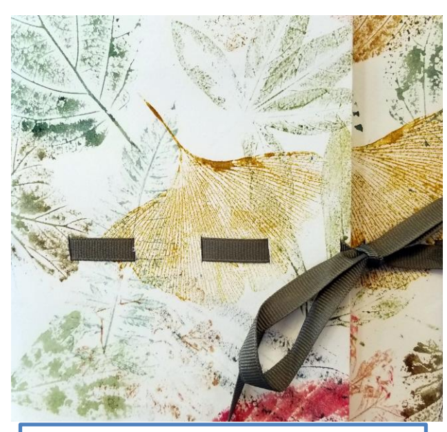
3D First Place: "My Paradise", watercolor/ink, Penny White