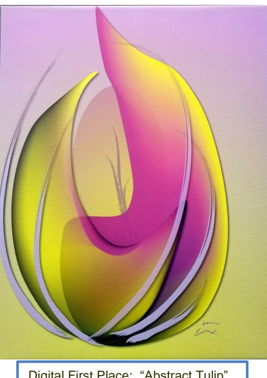
Digital First Place: "Abstract Tulip", Jeanne Ground