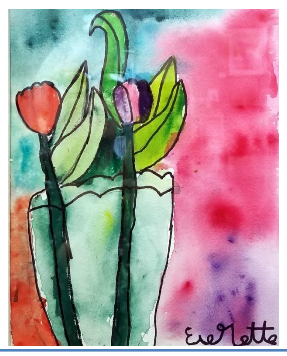
Kids' Art: "Tlips", watercolor, Everette McCarthy