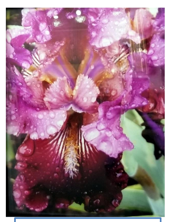
First Place Photography: "Chinese Dragon", Rachel Bennett