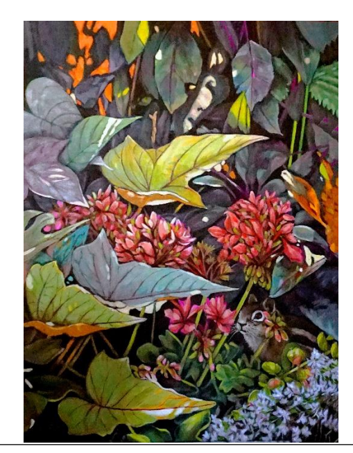
2D First Place: "Shelter" by Carol Sims