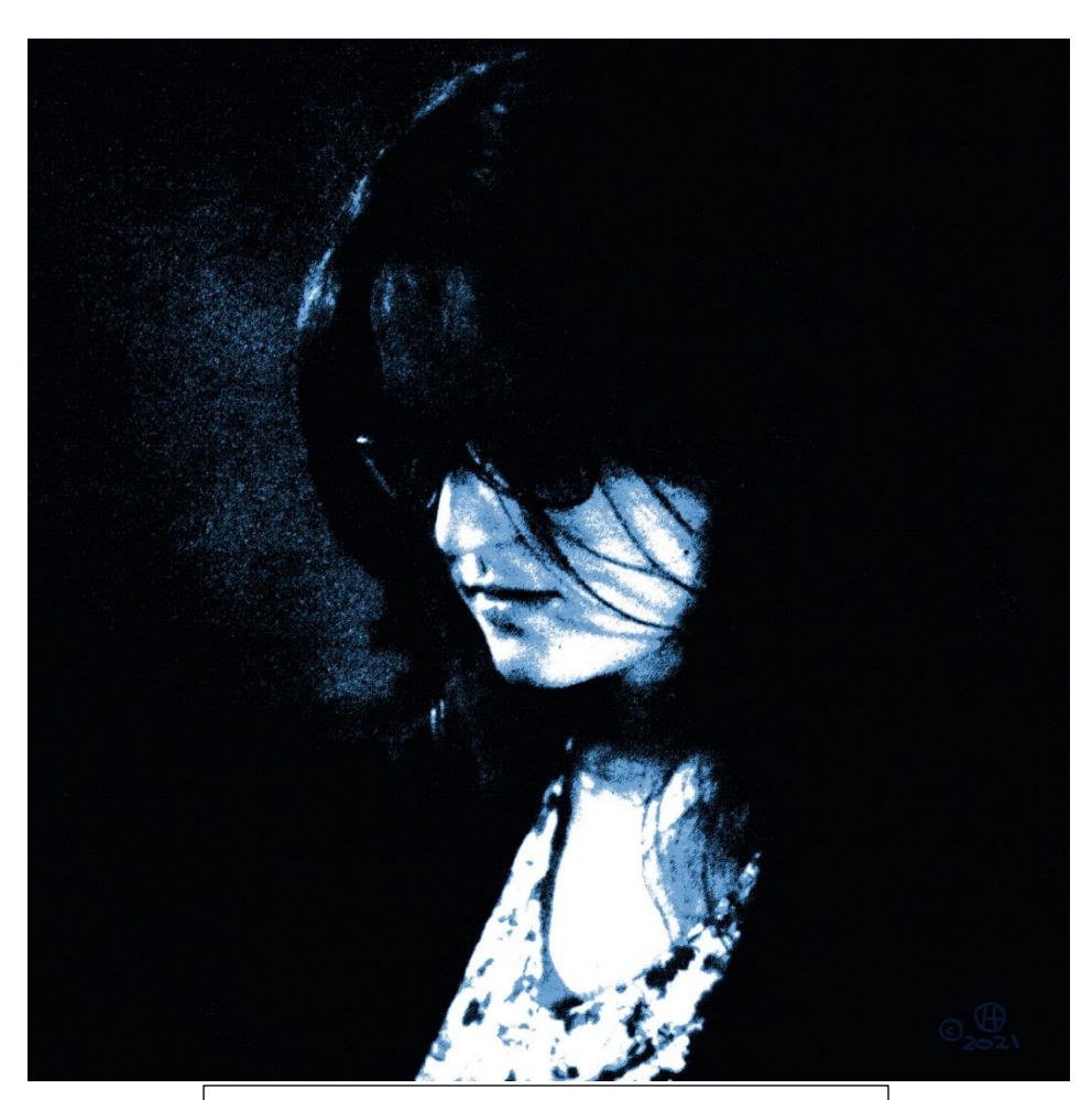
Best of Show: "Boni Blue" by Gary Olsen-Hasek