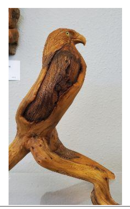
Other First Place: "Eagle in Found Wood", Tom Ham