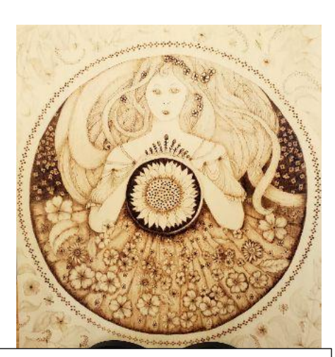
Pyrography First Place: "Nature Girl", by Barb Fromherz