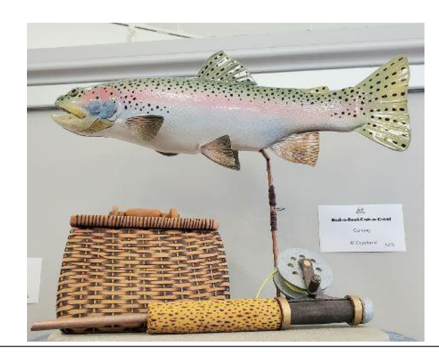
Realistic First Place: "Fish-n-Rod, Fish-n-Creel", by Al Copeland