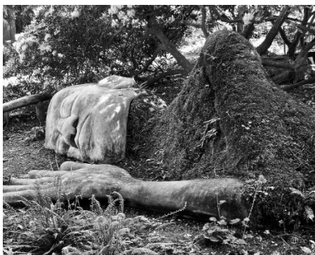
First Place, "Buddha Napping", Gary Olsen-Hasek

The detail of the ice-covered branches against the soft shapes in the background make this a great image. The eye is led off the frame to the right into that softness. The muted colors and darker tones help bring a very wintery feel to the image as well. Well captured!