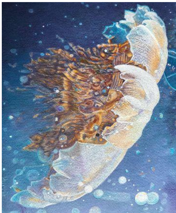
“Lion’s Mane Jellyfish – End of Life”