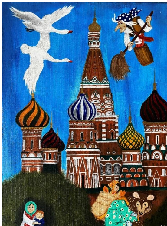
Best of Show, "Slavic Folk Tales", Angela Bakanov

This painting on canvas tells a story with its vivid colors, architecture and position of the characters. The towering buildings draw your eyes up and away from the drama below. Heralded by flying swans, a witch-like actor, the theft of a baby by a bear and a frightened mother and child--This piece of art tells a classic tale. Well done.