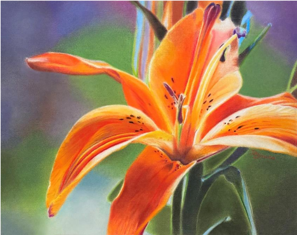
Best of Show, “Sunset In Full Bloom”, colored pencil, Debbie Bowen

This flower grabs the observer with a burst of striking colors. The extended petals guide the eyes toward the edges and then lead you back to the center of this beautiful lily. You can look right into the depth of the flower. The background brings the Color Wheel in full circle. The light source outlines the leaves softly and the petals sharply. Well done.