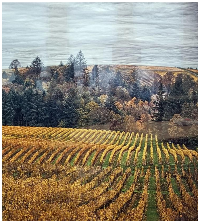
Photography First Place: "Fall Vineyard", by Doug Bearce