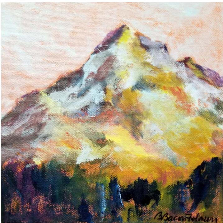
2 D First Place: "Alpine Glow", acrylic, by Barbara Folawn