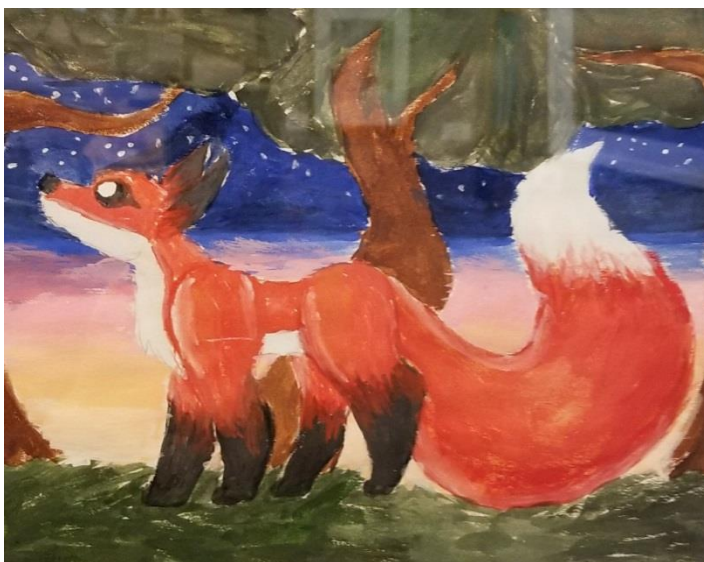
Kids' Art First Place: "Wilbur the Fox", watercolor, by Abby Deschon