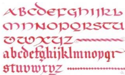
Calligraphy by billgrant.com

January 9 - February 27-CALLIGRAPHY taught by PENNY WHITE. In this fun and creative class you will learn the "Art of Beautiful Writing." Winter term will be a continuation of a script called Uncial and investigating variations of the simple rounded strokes that form this ancient writing style. Supplies needed will be discussed at the first class. All levels are welcome to this charming class. Bring your own cup for a Spot of Tea during class. Tuesday afternoons 1:30 - 3:30 pm. 8 weeks, $50.*