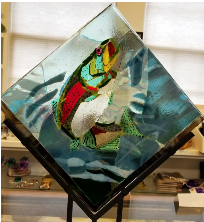
3 D First Place: "Rainbows", glass, by Mona Prater