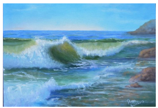
"Beach Wave", oil, Pam Bulthius CONGRATULATIONS, PAM!