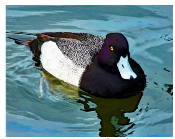
"Yellow Eyed Duck", digital, Gary Olsen-Hasek