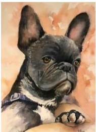
"Bubbles the Dog" by Dianne Hicks