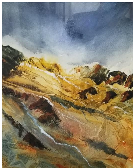
Third Place: "Incoming Storm", Nola Pear