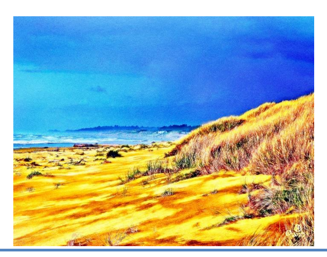
Digital Art First Place: "Spring is Coming", Gary Olsen-Hasek