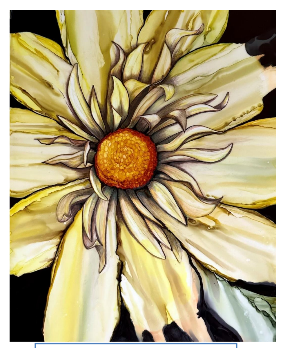
BEST OF SHOW: "DALIA DANCER", mixed media, DEE HENDRIX.