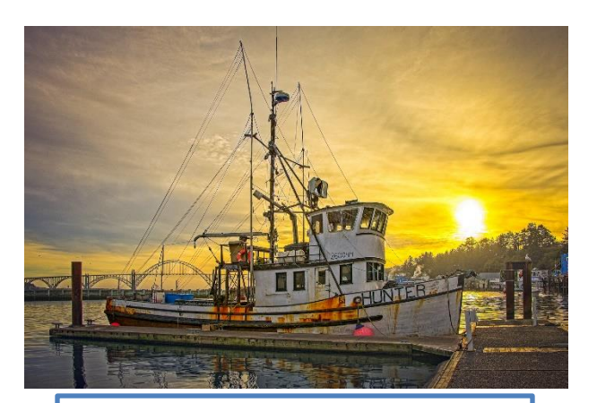
Photography First Place: "Old Yeller", Craig Leaper