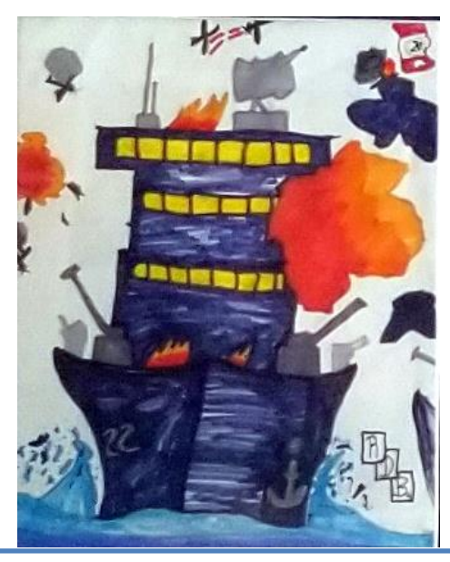
Youth Art First Place: "War in the Pacific", acrylic, Roman Berg.