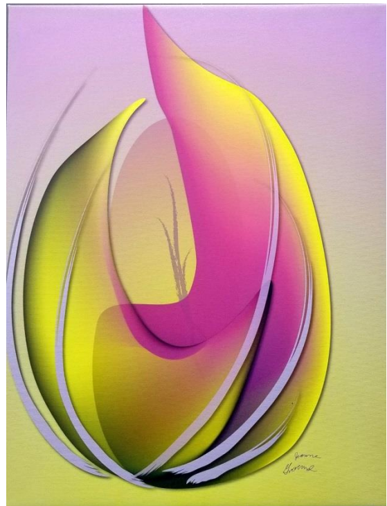
Digital First Place: "Abstract Tulip", Jeanne Ground