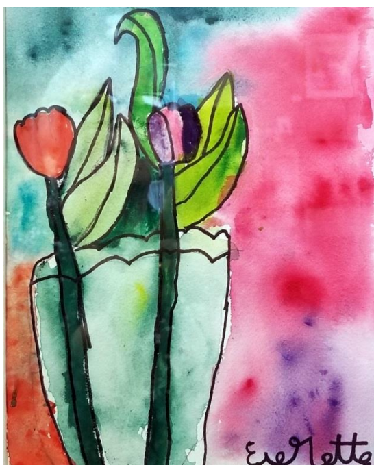
Kids' Art: "Tlips", watercolor, Everette McCarthy