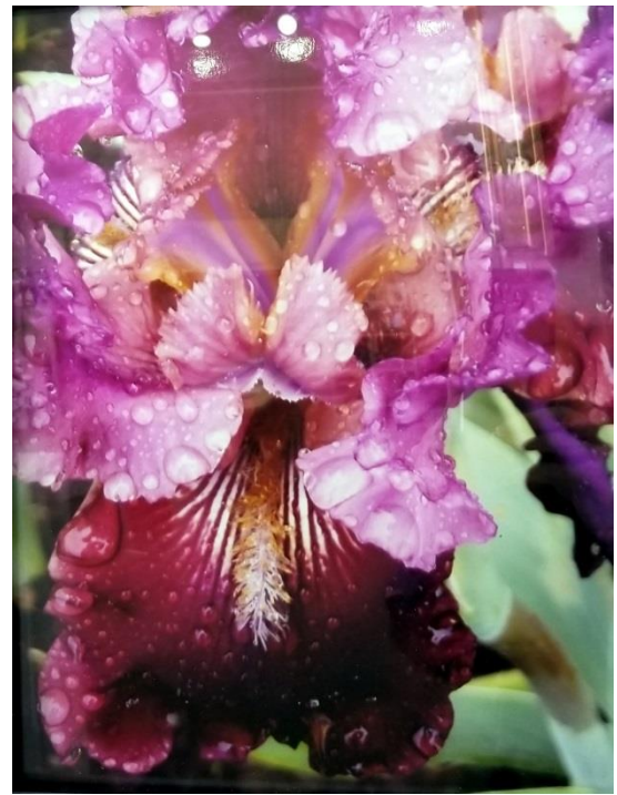
First Place Photography: "Chinese Dragon", Rachel Bennett