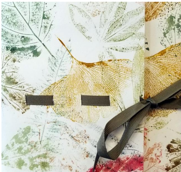
3D First Place: "My Paradise", watercolor/ink, Penny White