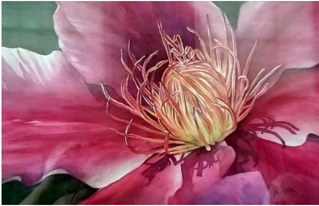
2D First Place: "Morning Splendor", Dianne Hicks