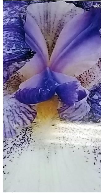
Photography First Place: "Hello Gorgeous", Karen Aiello