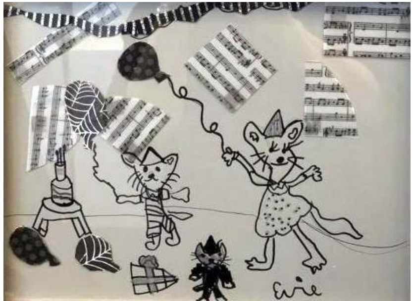
Kids' Art First Place: "Mice! Party On!", mixed media, Evie McCarthy, 6 years old