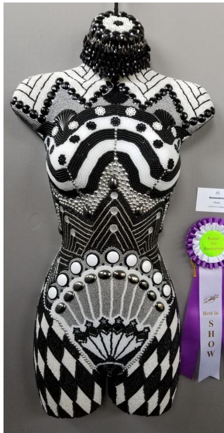
Best of Show: "Geometrics", beads, LaVonne Sallee