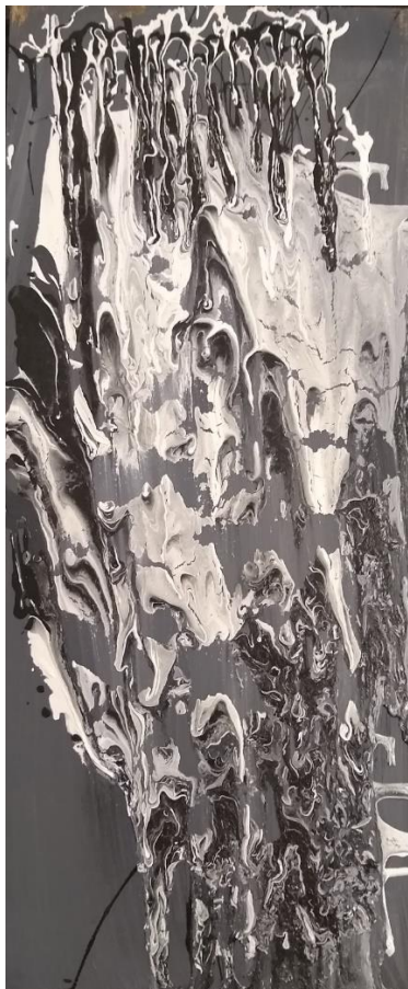
"MELTING GHOSTS", paint on wood, Laylee Julander, 10 years old