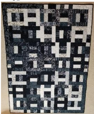
1st Place – "BLACK, WHITE & SHADES OF GRAY", textile, Janna Curtis