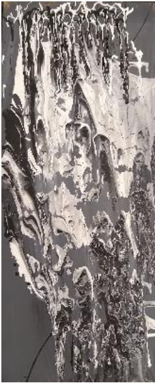
1st Place, “MELTING GHOSTS”, paint on wood, Laylee Julander, 10 years old