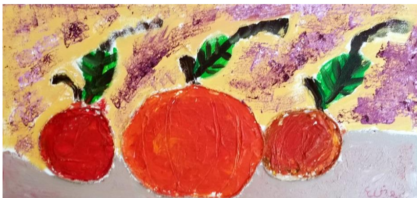
Kids' Art First Place: "Harvest Time", mixed media, Evie McCarthy, 6 years old