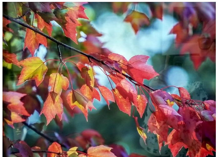
Photography First Place: "Autumn 3", photograph, John DeJarnatt