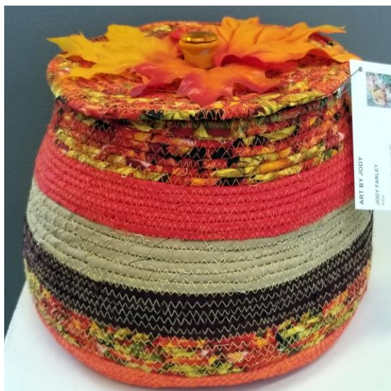
First Place 3D: "Colors of Autumn", textile, Jody Farley