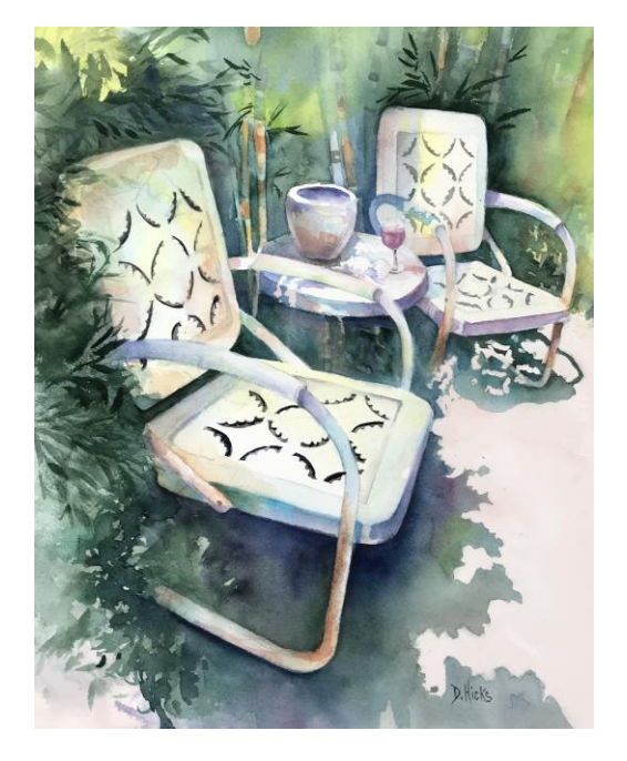
Third Place: "Tranquil Garden", Dianne Hicks